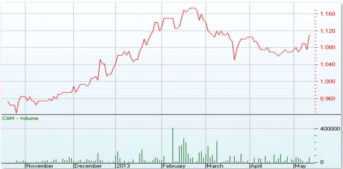
Figure: CAM Daily Line Chart

Copyright © 2013 Clime Capital Limited (ASX:CAM). All rights reserved. The information provided in this email and climecapital.com.au is intended for general use only. The information presented does not take into account the investment objectives, financial situation and advisory needs of any particular person nor does the information provided constitute investment advice. Under no circumstances should investments be based solely on the information herein. Climecapital.com.au is intended to provide educational information only. Please be aware that investing involves the risk of capital loss. Data for graphs, chart and quoted indices contained in this report has been sourced by IRESS Market Technology, Thomson Reuters, Clime Asset Management and MyClime unless otherwise stated. Past performance is no guarantee of future returns.