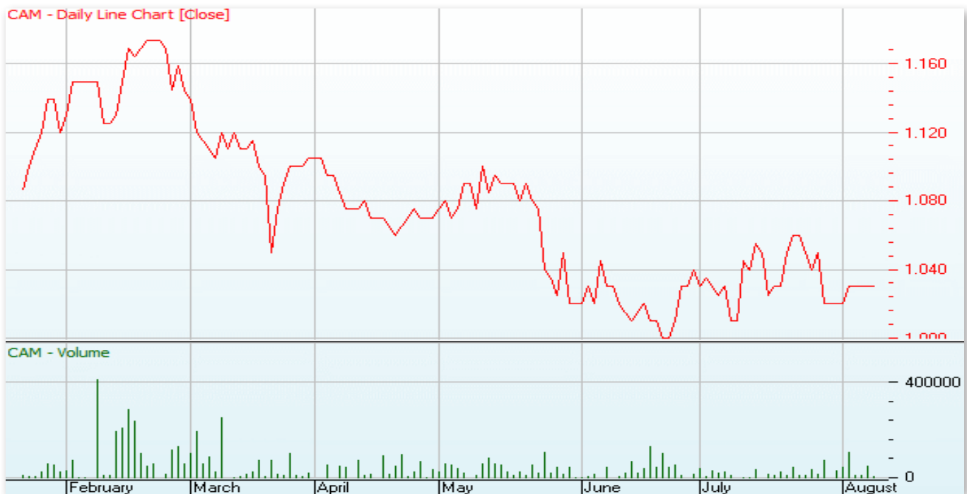
Figure: CAM Daily Line Chart

Copyright © 2013 Clime Capital Limited (ASX:CAM). All rights reserved. The information provided in this email and climecapital.com.au is intended for general use only. The information presented does not take into account the investment objectives, financial situation and advisory needs of any particular person nor does the information provided constitute investment advice. Under no circumstances should investments be based solely on the information herein. Climecapital.com.au is intended to provide educational information only. Please be aware that investing involves the risk of capital loss. Data for graphs, chart and quoted indices contained in this report has been sourced by IRESS Market Technology, Thomson Reuters, Clime Asset Management and MyClime unless otherwise stated. Past performance is no guarantee of future returns.