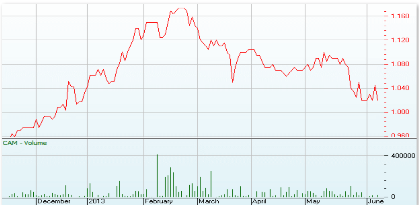
Figure: CAM Daily Line Chart

Copyright © 2013 Clime Capital Limited (ASX:CAM). All rights reserved. The information provided in this email and climecapital.com.au is intended for general use only. The information presented does not take into account the investment objectives, financial situation and advisory needs of any particular person nor does the information provided constitute investment advice. Under no circumstances should investments be based solely on the information herein. Climecapital.com.au is intended to provide educational information only. Please be aware that investing involves the risk of capital loss. Data for graphs, chart and quoted indices contained in this report has been sourced by IRESS Market Technology, Thomson Reuters, Clime Asset Management and MyClime unless otherwise stated. Past performance is no guarantee of future returns.