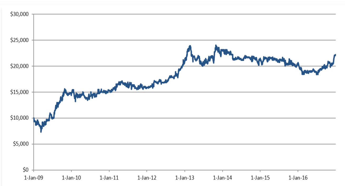
Clime Capital Limited (ASX:CAM)